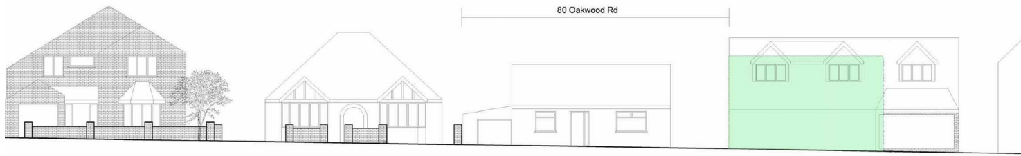
Existing Street Scene